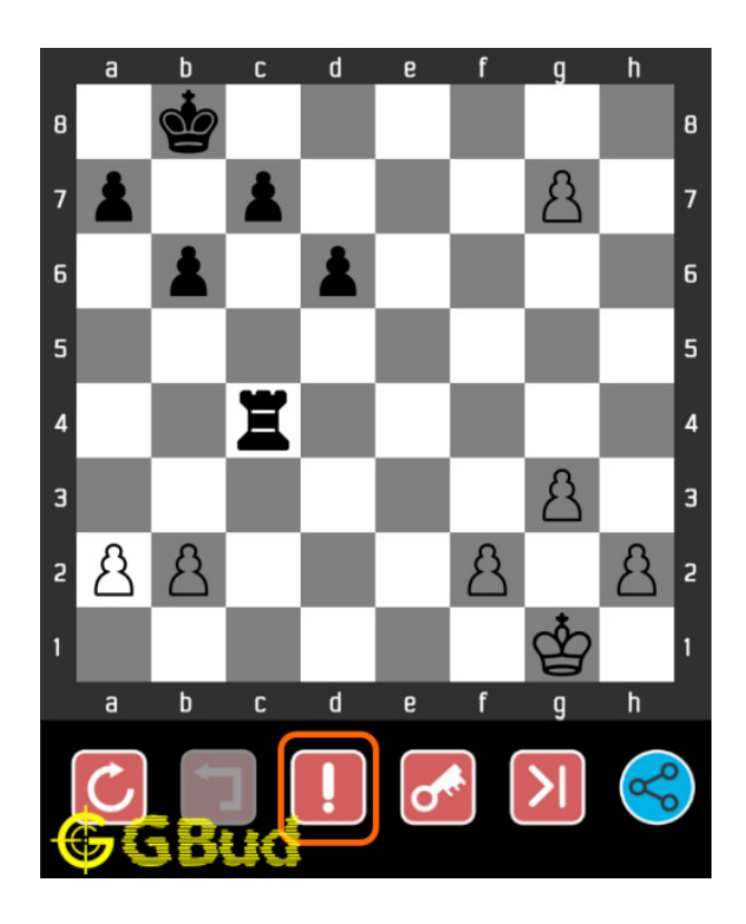
Figure 1.4: Click the help button to get help on next move @ https://gbud.in/g0vfw01