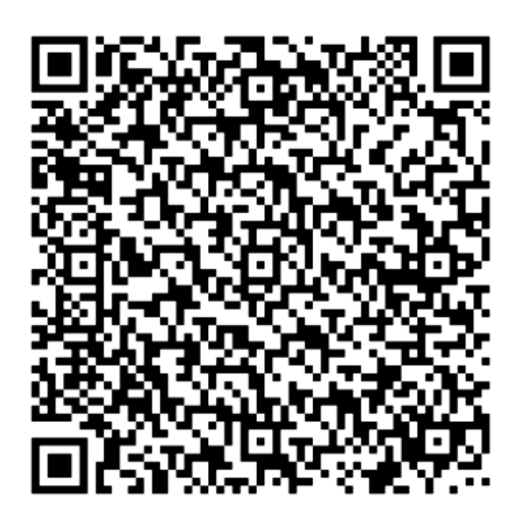
Figure 1.8: Solve this easy puzzle online by scanning this QR code or go to the link below